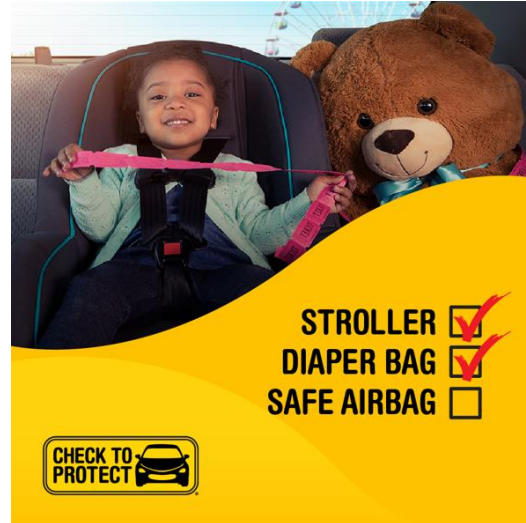
(CPST’s, we have resources available!)

CheckToProtect.org is available to all for a quick and easy vehicle safety recall check while discussing child passenger safety.